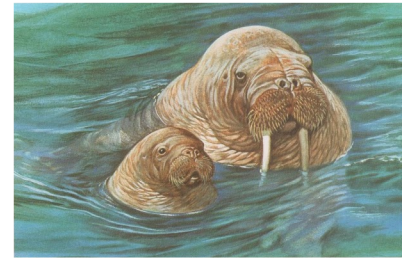
Bak alubeskot, lempolya va tanoy oc ginazhar, i va oc abrotcaf vas 1.30 m- doon zavzagitit remi mon barda. Radimion, gin walkratar. Kona sulemya arti mana barda lovile nazbolter nove dile me : koe Sibira, mon lok ke lempolyeem va oc oxam baleldeon inc nazhar.