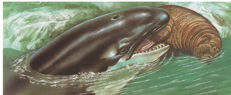
Birjol koe bira is batakaf rupol moe oppra va elkpkafa dratere va lempol tadled. Birjol ( valereon ) va lempolc dilon cidilfar vove va mlaki dize wupesar. Batakaf rupol va lempolc dize konatir isen ant mlakit surteson rodefacfar